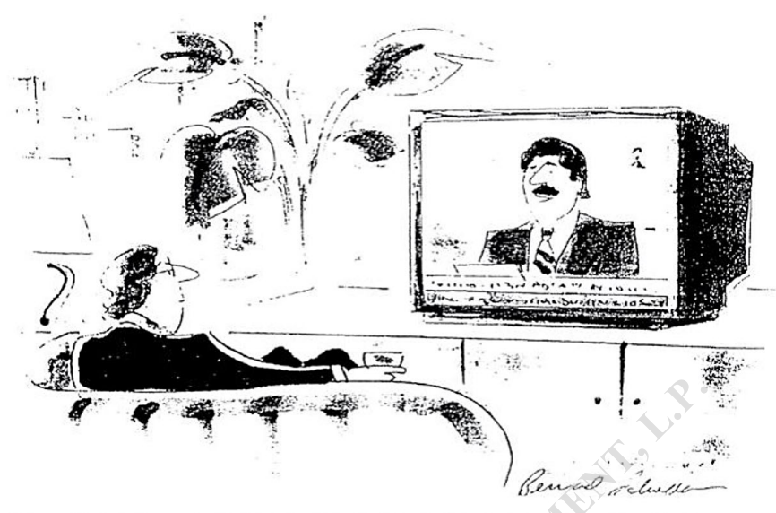
"Everything that was good for the market yesterday is no good for it today."

Another classic cartoon sums up this ambiguity in fewer words. It's highly applicable to the market tremor that inspired this memo.